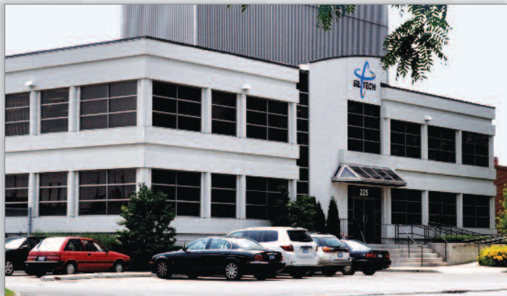
Toronto Head Office, Research Lab and Plant

Telephone: 416.424.4567 Facsimile: 416.424.3158