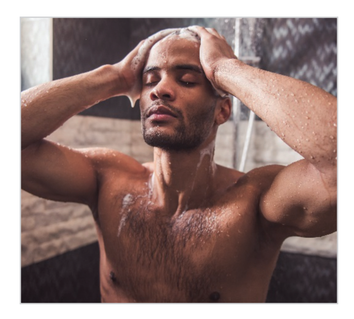
IDEAL FOR SHAMPOO AND BODY WASH!